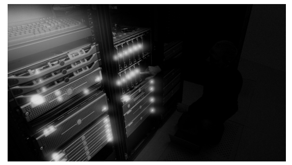
IR light reflects from object, reducing visibility.

Prevent excessive illumination on objects that are in the front of the scene while offering a clear B/W image without loss of detail.