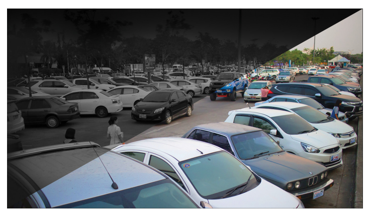
Monochrome and color image in near-total darkness.

Cameras equipped with a Star-Light Plus™ sensor provide crisp, clear B/W and color images even in near complete darkness.