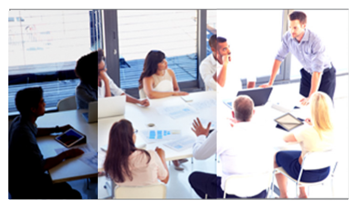
Details are visible in over and under exposed areas.

Cameras with true WDR technology have advanced sensors that can deliver clear images in a wider range of lighting.