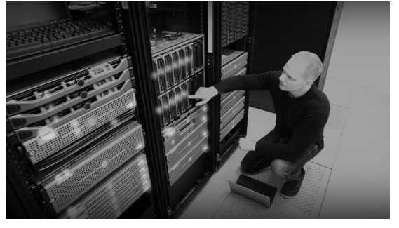
Smart IR™ distribute the IR light evenly in the FoV.